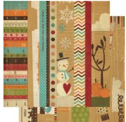
Simple Stories Year-O-Graphy

And we have the following great products coming soon: Studio Calico – Head Over Heels, Tim Holtz dies – some arrived many more coming, Echo Park – Winter Park and Style Essentials, new Dusty Attic chipboard and Dienamics Die.