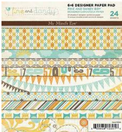
My Mind's Eye 6x6 pads