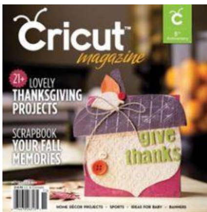
Cricut Magazine – November 2011