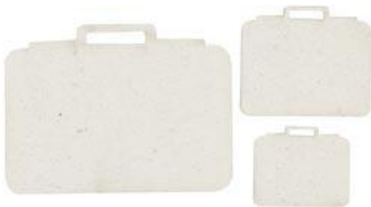
Fabscraps Chipboard Words and Images

There are some gorgeous new products in-store right now. Did you know you can view all the newest products in store? You can do so by clicking here .