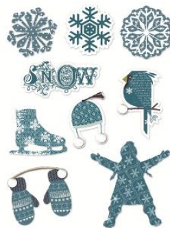
Little Yellow Bicycle Winter Twig