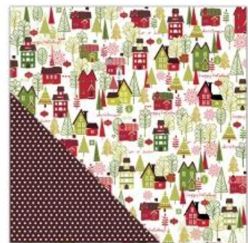
Little Yellow Bicycle Wonder and Wishes