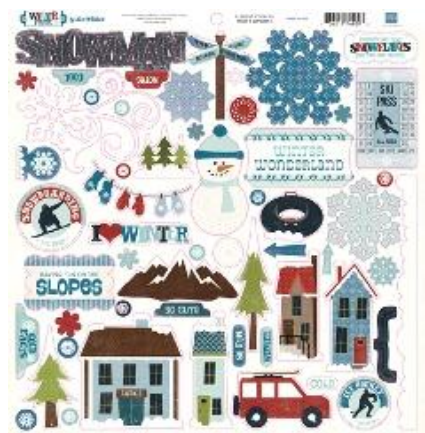
Echo Park Winter Park

Also available is American Craft Amy Tangerine and we have Fancy Pants Wonderland coming soon too!