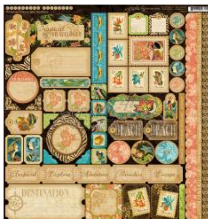
Graphic 45 Tropical Travelogue